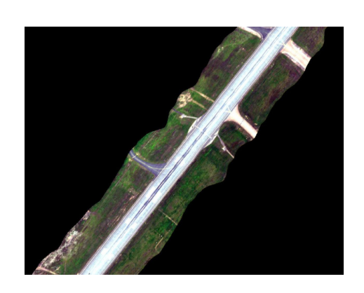
Georectified AisaFENIX image